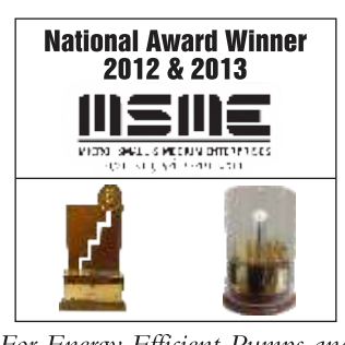
For Energy Efficient Pumps and Research & Development

We don't just offer Blowers , Boosters and Systems we offer SOLUTIONS !!