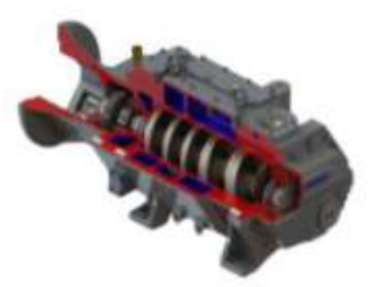
Fig 1: Everest Dry Screw Vacuum pump (Superscrew series)

Superscrew is the newest development in the vacuum pump industry (Fig 1). They offer a number of advantages over traditional vacuum pump designs. There is No Oil / No Water in contact with the process vapors, therefore they are considered as extremely environment-friendly. As these pumps are completely dry, the process vapor can pass through the pump without any contamination and be collected at the discharge of the system by a vent condenser. This offers the customer a very efficient vapor recovery management system and an environment friendly vacuum ecosystem.