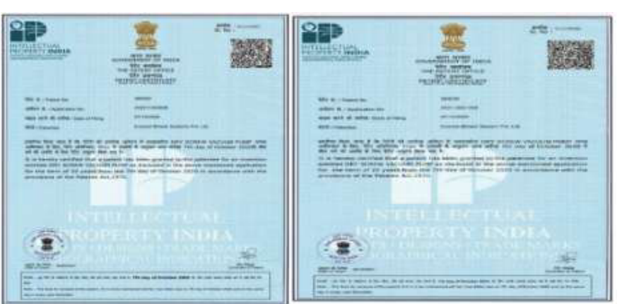
Fig 3: Patents granted to Everest Vacuum on Dry Screw Vacuum pumps Further, we have been granted Design Protection (Fig 4) for the Dry Screw Vacuum pump.